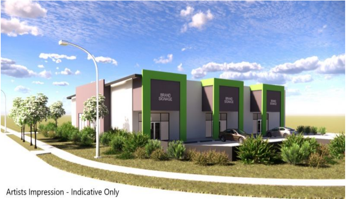
Artists Impression - Indicative Only