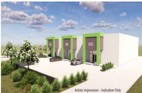
Artists Impression - Indicative Only